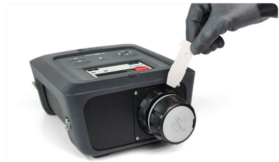
MX908 is equipped with modular accessories for ease of transition between solid, liquid, vapor, and aerosol sample types.