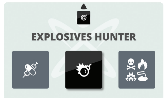
An obvious user interface guides users through each mission mode.