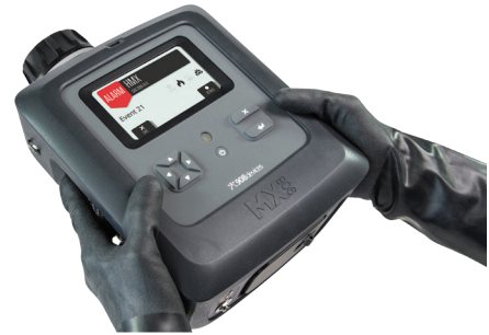
MX908 is rugged and meets the requirements for use in harsh environments.

Explosives Hunter is a mission mode for the detection of priority threats from military and commercial grade explosives, to homemade energetics and relevant precursors.